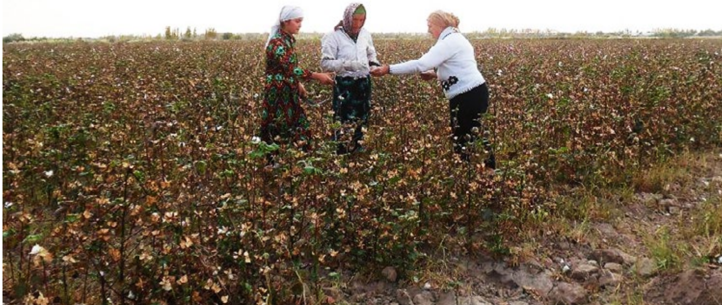
Distribution of booklets carrying information about the Uzbek legislation on the prohibition of Forced Labour (October 2015).