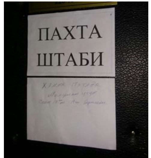
Inscription on the Mahalla door in the Bayavut district in the Syrdarya region. Above is written: “Cotton headquarter”, underneath: “Everyone went to the cotton harvest”.

“Only college students under age 18 stayed at college. The rest of them went to the fields. It was on the order of the regional governor. Everybody knows it. This happens to us compulsory-voluntarily. We call it ‘khashar.’ 40% of all employees went to the fields by the order of the hokim. 42