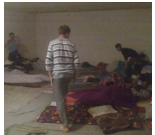
Usually, cotton pickers sleep on the floor - on mattresses they have to bring with them from home.

Although child labor did not occur on a systematic or mass scale in 2015, it remained a persistent feature of Uzbekistan’s cotton harvest. 83 The continued use of child labor reflects the key problem of coercion inherent in the cotton system in Uzbekistan. Although local officials and school and college administrators generally understood that they should not send children to the fields, they were simultaneously under enormous pressure from central officials to deliver harvest quotas or face penalties and in some cases resorted to the use of child labor. A third-year student from Jizzakh forced to pick cotton told us, “They started bringing second-year students to the fields on September 21 and first-years on September 26, and brought them back to class on September 30. They were brought to help us. They weren’t counted as first- and second-year students, they were counted as help for the third-years.” 84 A college teacher from Jizzakh told us that the college resorted to mobilizing second-year students to fulfill their recruitment requirements.