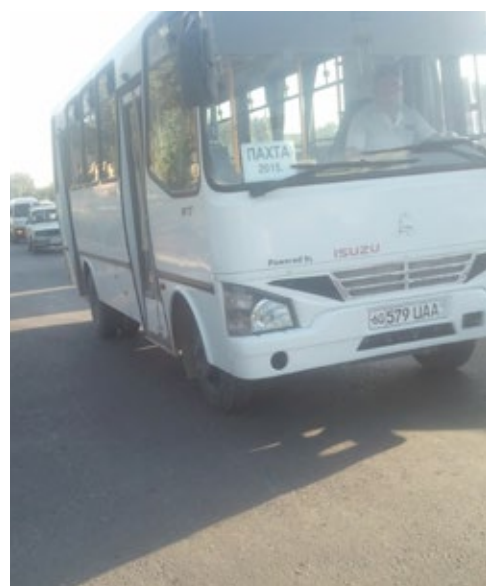
A bus is delivering public sector employees to the cotton fields (in the bus window, there’s a sign saying “Cotton 2015”).

The government unleashed an unprecedented campaign of harassment and persecution against independent monitors to attempt to cover up its use of forced labor while taking pains to make widespread, massive forced mobilization appear voluntary. In some cases it forced teachers, students,