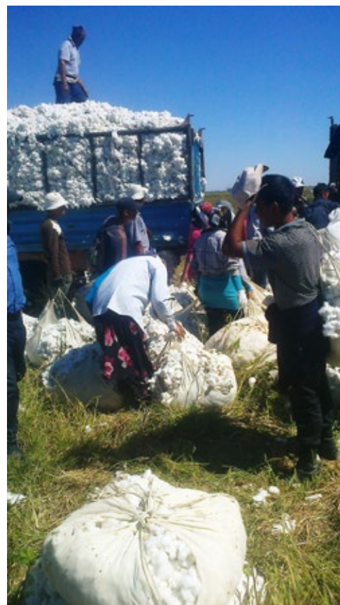
Evening submission of cotton (September 2015).

Farmers are forced to plant state-ordered acreage of cotton and wheat or face the loss of their land. The fact that they sign leases stipulating these requirements does not make them voluntary. 11 The Uzbek government regularly coercively mobilizes citizens to perform unpaid labor or low-paying agricultural work that is in addition to their regular employment. In the agricultural sector, this includes preparing fields for planting, planting cotton, weeding, and harvesting. Officials impose