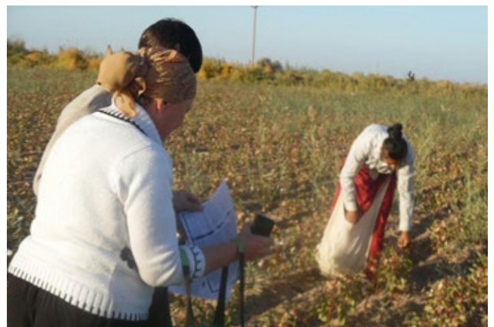
Our monitors went to the cotton fields informing the pickers about their rights and handing over information flyers. (September 2015, Khorezm Region)

Our monitors experienced significant harassment and interference by the Uzbek government in 2015 as it made efforts to appear cooperative with ILO monitoring and compliant with World Bank agreements while continuing to use forced labor. Government officials attempted to prevent monitors from observing mass mobilization of people to harvest, speaking with people being sent to pick cotton, visiting cotton fields, attending meetings, or gathering documents. Several monitors faced severe reprisals for conducting this work, as explained in further detail later in this report. Some had to curtail their monitoring due to harassment and interference. In 2015, monitors carried out research using a variety of methods, including the following six main methods: