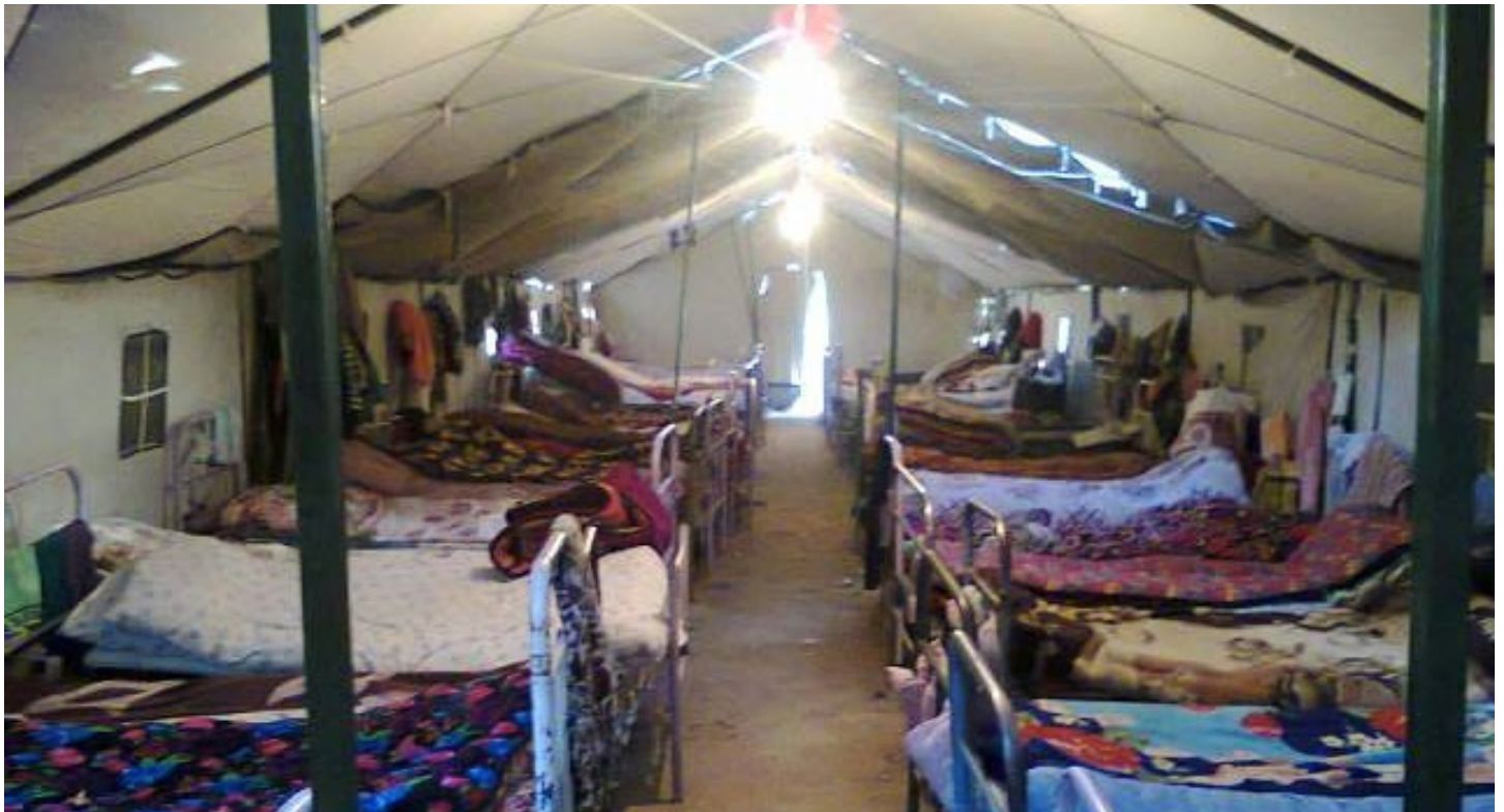
In some regions, tents were set up for accomodating cotton pickers.