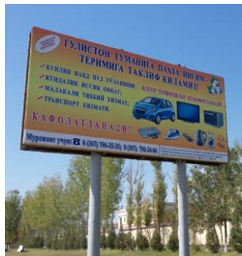
Inscription on the poster: “We invite to harvest cotton in the Gulistan district”. On the right side is a very small note informing about the telephone numbers for complaints within the Feedback Mechanism.

The posters and banners were displayed in public places, but not near farms or fields where people picking cotton could see them. In the six regions we monitored, we observed that the banners were generally displayed near markets and on main streets. We found the smaller posters displayed on and in buildings of public institutions, such as colleges and local administrations. When asked if she saw the awareness raising materials a nurse from Kashkadarya replied “I didn't see them. Because we were at the fields. Who brings posters to the fields? Maybe they were in other places but there was nothing like that where I was.” 157 There appeared to have been little oversight as to whether the