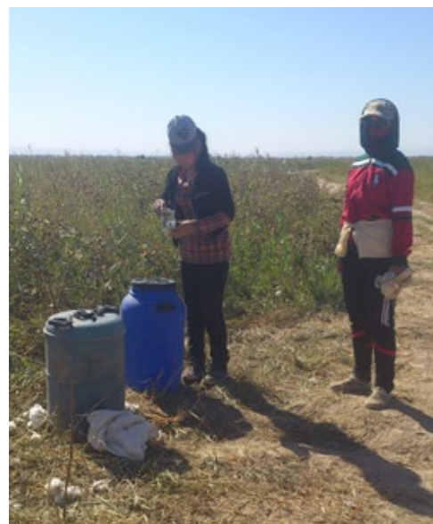
On the cotton fields, people got water from containers.