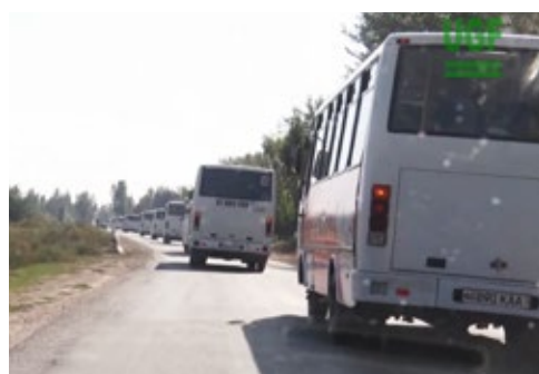
Columns of busses took students to the cotton fields

Students told us they feared problems with their studies if they refused to pick. Some were directly threatened with expulsion if they refused to pick cotton. More commonly, however, students told us they feared they would receive poor grades, have disciplinary troubles, and experience difficulty entering university or getting jobs. For example, a college teacher from the Syrdarya region described threatening students to ensure their participation in the harvest, “[We warn] students that if they don't pick cotton they will not receive good grades. We say things to coerce them and ensure they go to the fields; we warn parents that their children will get expelled [if they don't pick cotton.” 54 A student from Kashkadarya said if students refuse to pick cotton “[teachers] tell us we won't