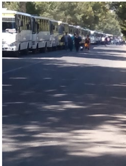
Starting on September 4, columns of busses were organized to take cotton pickers to the fields.

We [the mahalla committee] were supposed to organize the entire mahalla and mobilize a minimum of 100 people to pick cotton in the name of the mahalla. Forced or mandatory, no matter how you formulate this word, the meaning is the same: to get people to go to the fields and harvest cotton. No one wants to go of their own will to harvest cotton for miserly wages. 43