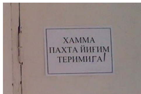
Announcement at a clinic in Jizzak Region: "Everyone went to the cotton harvest".

Education and health sector workers were another group forced en masse to work in the cotton fields in 2015. Notwithstanding the government's stated commitments not to recruit teachers and health care workers, our research shows no discernible difference in the forced mobilization of these workers in 2015 from previous years, when they were also forcibly recruited in large numbers. 62 Officials sent teachers and medical workers to pick cotton for rotating shifts of 15 – 25 days or for single extended shifts of up to 40 days during the 2015 harvest. Those who had completed their shifts or did not pick cotton were forcibly mobilized to work on weekends and