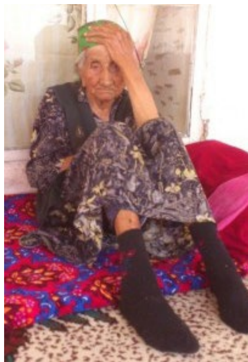
A relative of a dead forced labor victim. (Tashkent region)

The unwilling participation of millions of people in a system that strips them of basic labor protections is made possible by fear. Forced labor in Uzbekistan occurs in a context of entrenched repression and widespread human rights violations. 99 Uzbekistan consistently ranks among the worst human rights abusers in the world. 100 Courts are neither independent nor trusted by the population as impartial, and serious due process and other rights violations are rife in the criminal justice system. The use of torture against detainees and convicted prisoners is systematic and routine. 101 The government imposes severe and undue restrictions on the freedoms of religion, speech, assembly, association, and other fundamental freedoms. 102 The government subjects journalists, civic activists, independent political and religious figures, and human rights defenders to harassment, surveillance, and interference in their work, and in some cases imprisonment, ill-treatment, and torture. 103 Local neighborhood councils, known as mahalla committees, cooperate closely with the police to monitor and report on residents. Mahalla committees have authority over welfare payments, such as invalid and child benefits, as well as utilities, and withhold these punitively against residents. 104 Citizens who complain