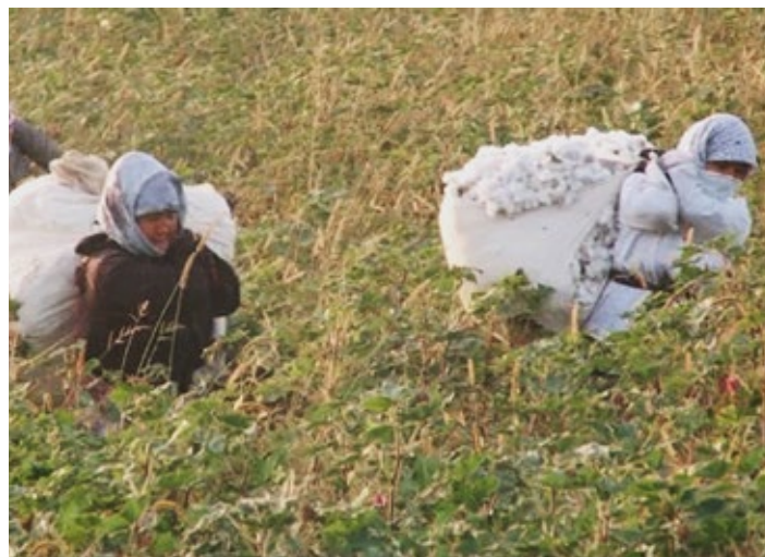
On the cotton fields (October 2015).

Given these stakes, cotton production is highly centralized and tightly controlled by top-level government officials