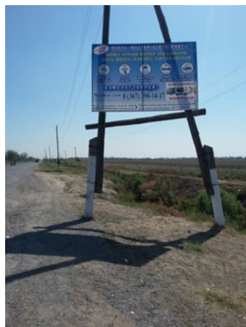
The information billboards were often placed at unfavorable places, the telephone numbers for complaints often difficult to read.