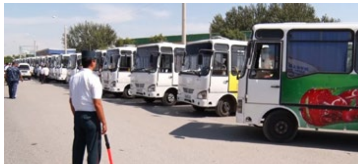
In September, the traffic police is very busy with organizing busses to take cotton pickers to the fields.

The ILO notes that “...common threats used against workers include ... loss of wages or access to housing or land, sacking of family members, further worsening of working conditions or withdrawal of “privileges” such as the right to leave the workplace. Constantly insulting and undermining workers also constitutes a form of psychological coercion, designed to increase their sense of vulnerability.”