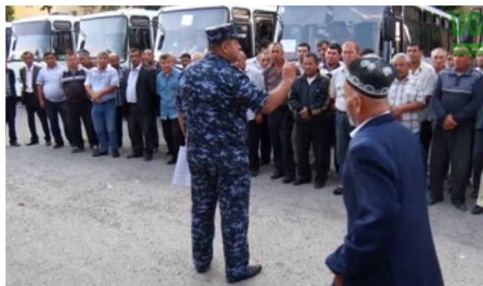
Drivers are being instructed by traffic police officers to safely bring students to the cotton fields (September 2015).

the harvest were in the range of 25 – 50 kilograms per person. This means that 67 – 134 million person days were required to harvest the crop. While a small amount was mechanically harvested, and some was picked by truly voluntary labor, the vast majority of the days in the cotton fields were put in by forced laborers or day laborers people paid out of their own pockets to avoid doing the work themselves. Conservatively estimating to account for the unknowns, the government forced more than a million people to pick cotton in 2015.