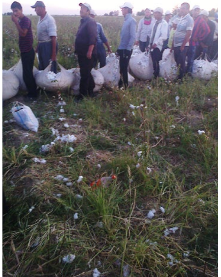
Evening delivery of cotton. Usually, employees from the public sector sign on to collect a daily quota of cotton (the average amounts to 50 kg per day).

Despite the government's efforts to cover up forced labor and impede effective monitoring, the ILO concluded that forced labor remains a problem and significant reform efforts are needed. Despite these findings, the Uzbek government continued to receive World Bank funds. As detailed in the final chapter of this report, the Uzbek-German Forum urges the Uzbek government to end the coercion and corruption that pervade its cotton sector and violate the rights of its citizens, and calls on the World Bank, United States, European Union and ILO to hold Tashkent accountable for its international commitments.