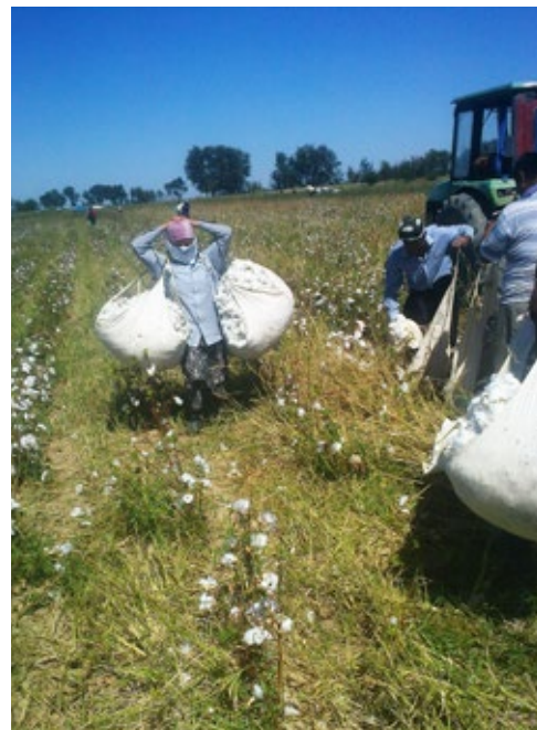
On the cotton fields (September 2015).

The government's direct and total control of the cotton sector sustains a system of patronage, is the root cause of forced labor, and remained unaltered in 2015. The system is organized from the top down and its implementation involves officials at every level. 16 In the first quarter of the year, the president, prime minister, ministers of the Agriculture and Water Resources, the Economy, Finance, Foreign Economic Relations, and Investments and Trade ministries, and representatives from the state-controlled cotton association set the national production target. 17 The prime minister issued quotas to the regional hokims, who, with the cotton association, imposed production quotas on farmers through their land lease agreements and procurement contracts. Farmers, who do not own their land but lease it from the government, were, as in previous years, obligated to sell their cotton to one of the state-controlled gins at the state price. The Finance Ministry set the procurement price for cotton – the price paid to farmers – below the government's own estimate of production costs. 18 The government also establishes the rates paid to workers for harvesting, which are substantially lower than market wages, perpetuating the need for forced labor.