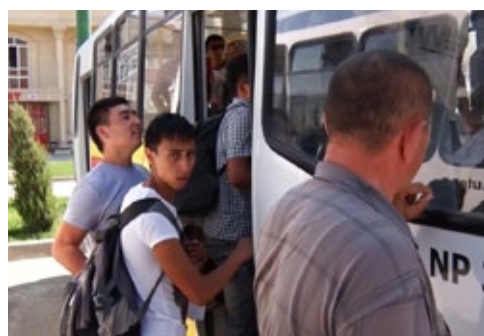
Students taking the bus to the cotton fields (September 2015).