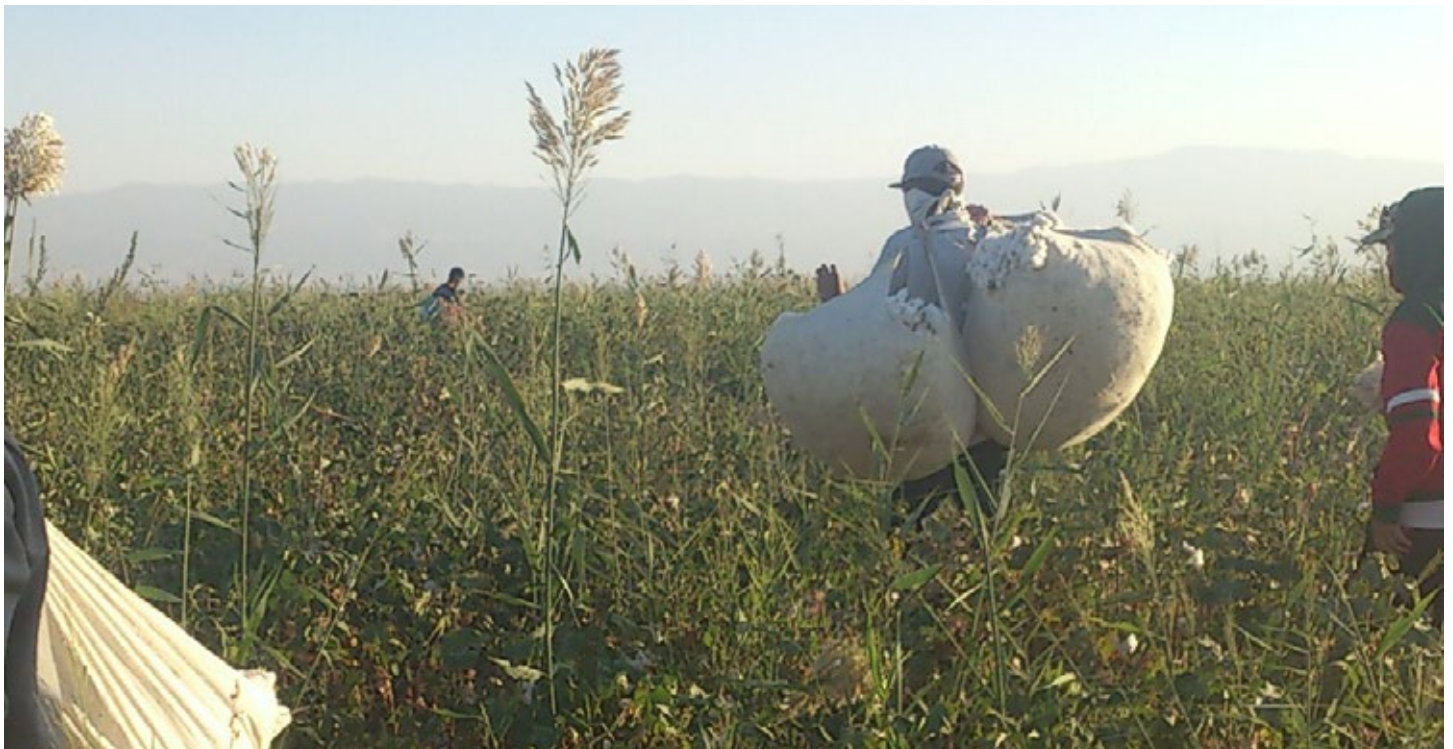
Almost all of the cotton crop in Uzbekistan is being harvested by hand. (September 2015)

Instead of good faith efforts to reform, the government appeared to double down on coercion. The government's 2015 "re-optimization" plan for agriculture punished farmers in debt or who failed to meet production quotas by taking back their land. Under another plan known as "Clever," the prime minister ordered bailiffs and police to repossess the farmers' property for debts or unfulfilled production quotas. They confiscated livestock, tractors, even televisions without court orders or valuation processes. As in previous years, the government imposed cotton production quotas on farmers and exerted control over every aspect of production. The government's procurement price for cotton, set at less than production costs, and system of government-controlled monopolies for agricultural inputs and purchasing, conspired to keep farmers in a cycle of crippling debt.