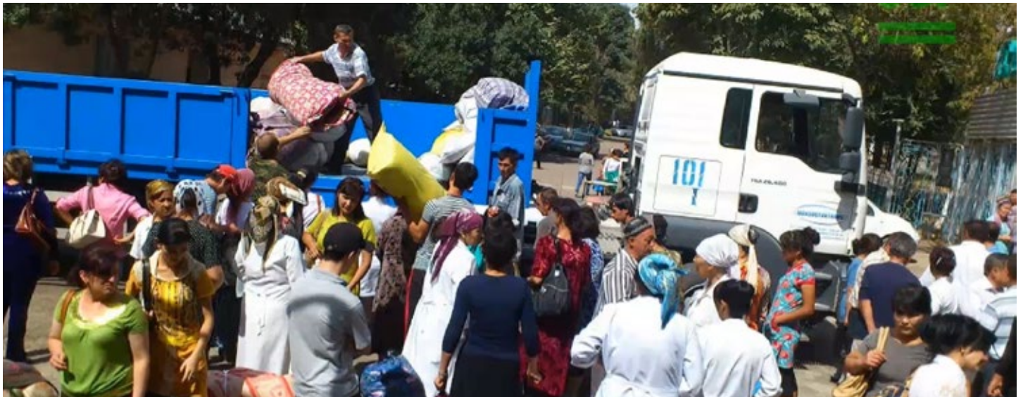
Medical workers on their way to the cotton fields.

teachers in the fields. The director of the college is in control every day and gives us the orders. We go the fields or don't go according to his orders. He tells us and we do it." 47