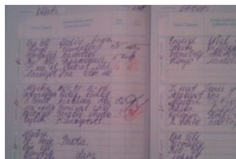
Exercise book of 6-year school pupil from a school in Andijan City. Inscription on October 14, 2015: "Cotton → Day off".