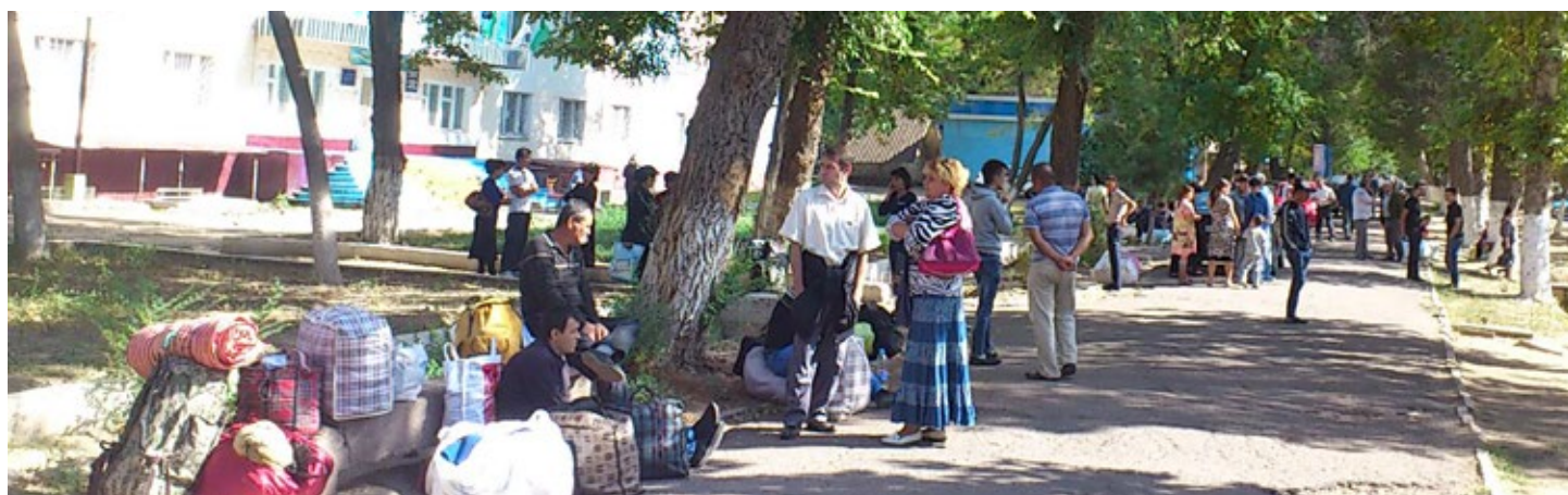
Public sector employees in the Tashkent region on their way to the cotton fields.