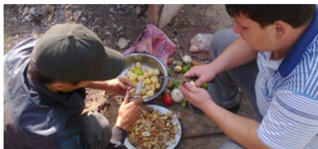
Students are preparing dinner for other cotton pickers on the accommodation sites next to the fields.

A parent of a student forced to pick cotton described terrible living conditions. He said, "In my view, not one person of sound mind would ever willingly let his children go there. There was no water, no gas, barely any living conditions. There was no heating system to speak of. The windows were hung with rags. The glass was broken. There were no arrangements for hygiene. There was nowhere to wash." 168